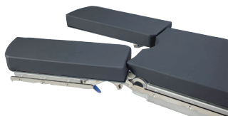
Two-Part Leg Section for midline access.

Hillrom offers an additional accessory package of specialty components that optimize patient positioning capabilities for complex robotic-assisted surgeries.